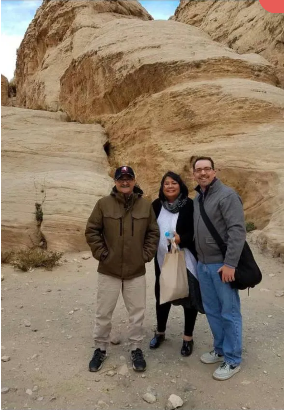
Got to tour Petra with good election friends from the USA.