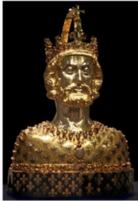
Bust of Charlemagne (Charles the Great, also known as Charles I, l. 742-