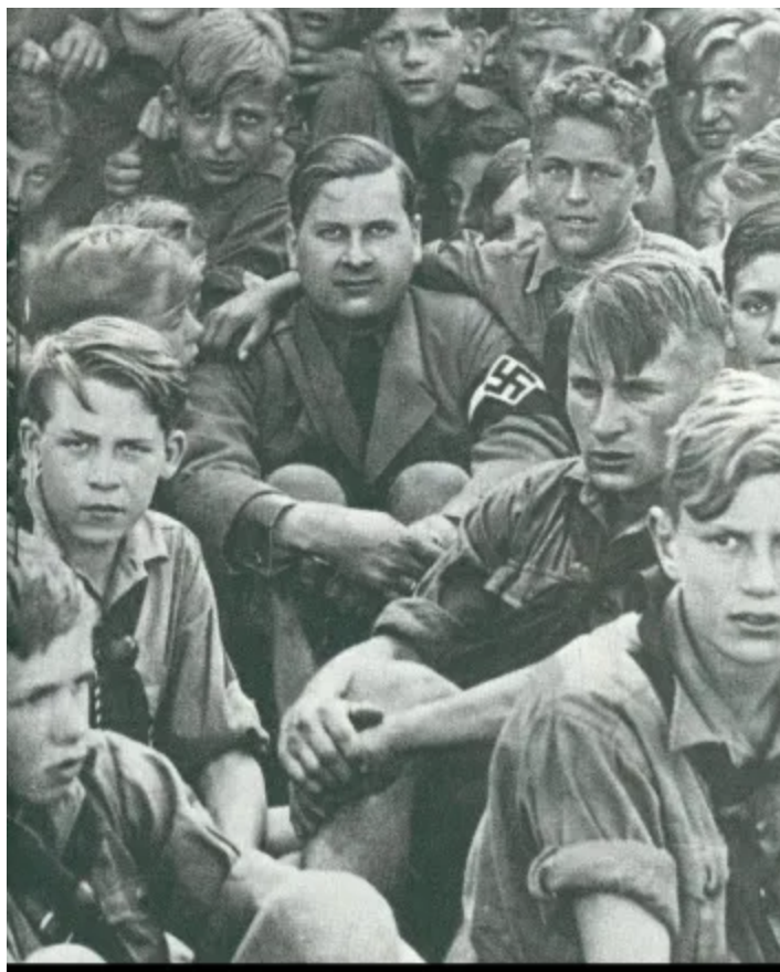
Hitler Youth leader Baldur von Schirach was known as "The Baby" by the Nazi inner circle of pederasts.

Urania - Part 3 revealed the recruitment pool used by Ernst Rohm and the SA. We cast no accusation against anyone working within American Legion, however this pattern shared by the two organizations is eerily similar: